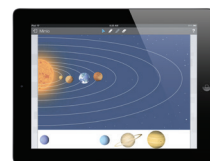
Student using the MimioStudio Collaborate feature.

Get the most from your mobile devices with truly collaborative learning.